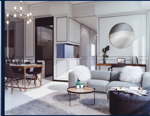
4 - Bedroom