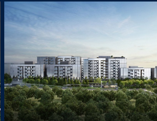
1 - Bedroom + Study