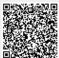
Scan QR Code