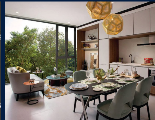
1 - Bedroom